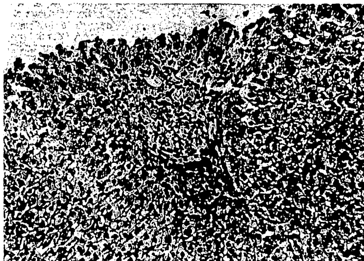
Fig. 1 Patient 1. Liver biopsy showing mononuclear infiltration of a portal tract. No piecemeal necrosis of the limiting plate. Diagnosis: chronic persistent hepatitis. Haematoxylin and eosin \times 65 .

with chronic active hepatitis as well as patient 10 are now on continuous oral treatment with 0.2-0.3 mg/kg of prednisolone, which appears to be well tolerated. Treatment was followed by a marked improvement of subjective symptoms (fatigue and malaise) in all; SGOT returned to normal in patients 6 and 7, who are now on steroids for six and four months respectively, but it remained unchanged in patient 10 with cirrhosis. No specific treatment is now being given to the remaining three patients with chronic active hepatitis (5, 8, 9) because it was